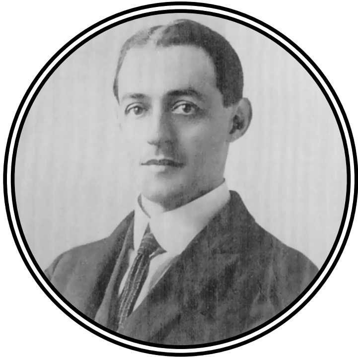
ARTHUR W. PINK (1886-1952)